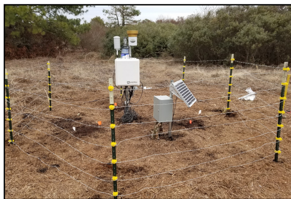
Fig. 1. Soil moisture monitoring station in the Pocosin Lakes National Wildlife Refuge in northeastern North Carolina

The State Climate Office of North Carolina (SCONC) has established a system of soil moisture monitoring stations (Fig 1) at select locations to collect data on soil moisture and weather at locations in coastal North Carolina. Monitoring data is integrated into the Fire Weather Intelligence Portal ( https://climate.ncsu.edu/fwip ), an existing resource, and is being used to assess and address coastal fire conditions and risks.