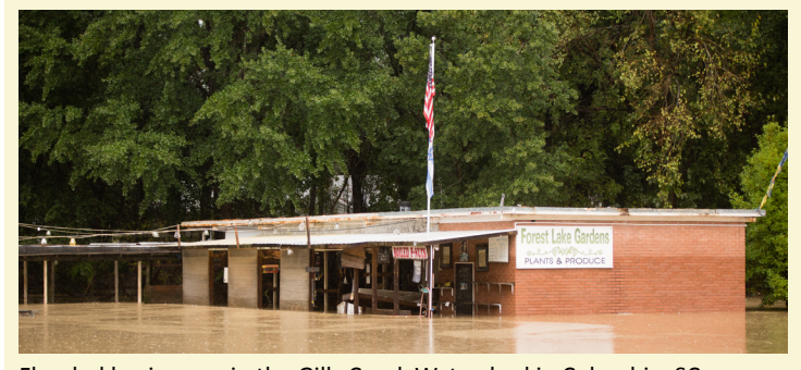
Flooded businesses in the Gills Creek Watershed in Columbia, SC on October 4, 2015.

Would You Like to Contribute? The CCoP welcomes any information or pictures that can help tell this story. They are particularly interested in documenting any climate adaptation or resilience efforts that may, or may not, have been effective in mitigating the impacts of the storm. This might include information about early warning and communications with residents or images of how different types of infrastructure fared through the storm. If you have any information or images to share, please e-mail them to Liz Fly at elizabeth.fly@scseagrant.org. Be sure to include a source for all submissions.