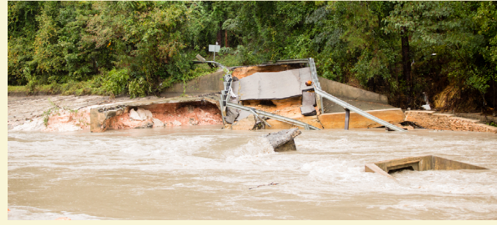
A breached dam in the Arcadia Lakes neighborhood located in the Gills Creek Watershed in Columbia, SC.