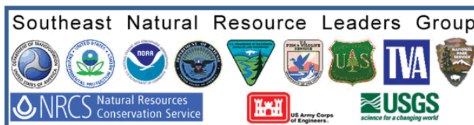
Figure 13.2. Members of the Southeast Natural Resource Leaders Group

The project is being directed through the Southeast Natural Resource Leaders Group (SENRLG) (U.S. EPA 2011b). SENRLG is comprised of regional Federal agency leaders across the SE with natural resource mission responsibilities (Figure 13.2). The SENRLG Landscape Conservation and